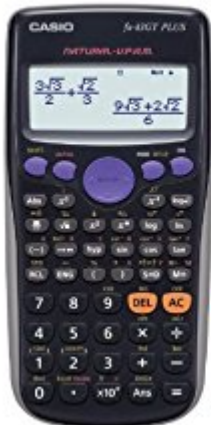
Casio FX-83GTPLUS Scientific Calculator by Casio

Amazon's Choice for "casio scientific calculator"