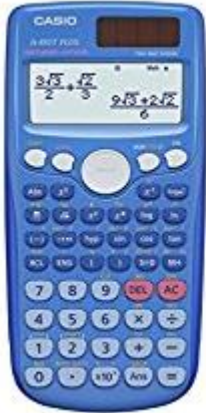
Casio FX-85GTPLUSBLUE Scientific Calculator by Casio

£10.89 £13.99 ✓prime Exclusively for Prime Members